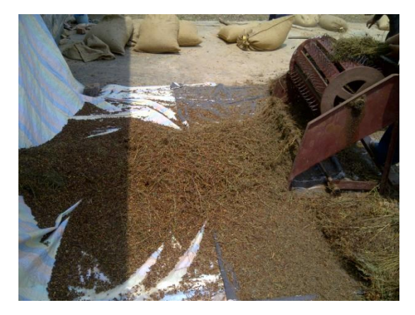
Well filled pods of variety PL8 after threshing