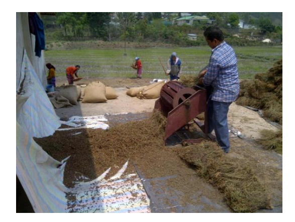
The crop can be threshed using a Paddy Thresher

Among the above varieties, PL -6 is a yellow seeded variety and preferred by the snacks industry. Seeds for all the above varieties are available through the national system.