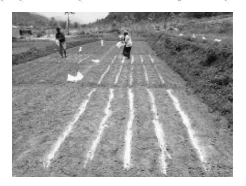
Fig. 2: Furrow application of lime in the experimental plots

and K were applied through urea, single super phosphate (SSP) and muriate of potash (MOP), respectively. Half of the N along with full doses of P and K was applied before sowing, while remaining half of the N was applied in two equal splits at 45 and 75 days after sowing. Lime was applied in furrows (Fig. 2) seven days before sowing and properly mixed with the soil. All recommended agronomic practices were followed during crop growth and the grain yield was recorded after harvesting the crop at maturity. Data were analyzed using the SPSS version 16.0 statistical package (SPSS Inc., Chicago, USA). Significance of the treatments' effect was considered at 0.05 probability level. The treatments' means were segregated using Duncan's Multiple Range Test.